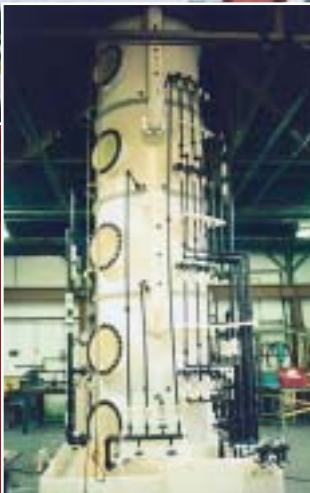
Plastic scrubber fabrication