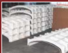
Polypropylene tank covers

Atlas designs and fabricates such plastic structures as tanks, fume hoods, ducts, and tank covers. These custom structures are made in its Mertztown facility and shipped throughout North America.