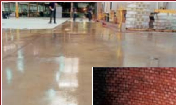
Epoxy floor coating

Atlas' fast-curing polymer concretes are ideal in applications where time is at a premium. Available in vinyl ester, epoxy and furan, these polymer concretes allow floors, pump pads and sumps to be poured and put in service within a matter of hours.