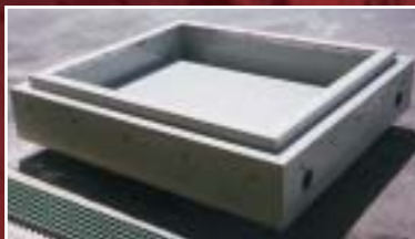
Precast polymer concrete