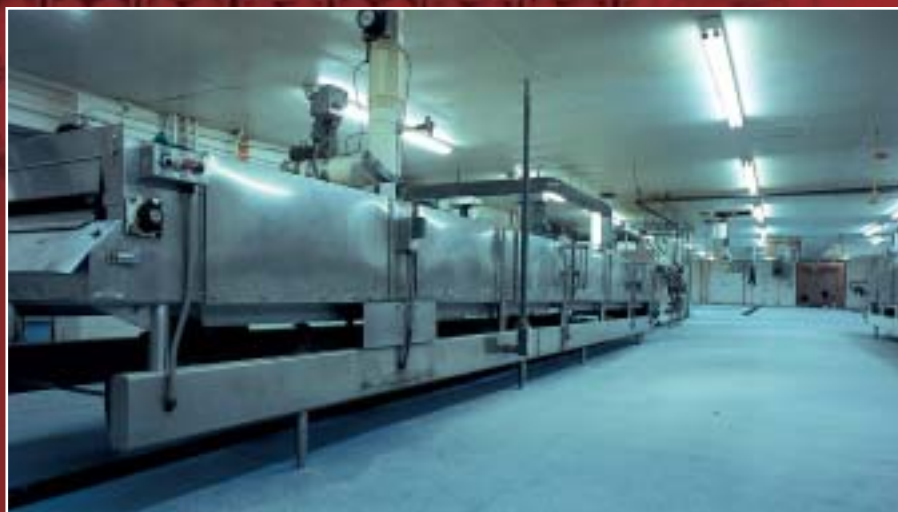
Epoxy polymer floor

Atlas' thin and high-build coatings are based on a variety of high-performance resin systems. These coatings are appropriate for secondary containment, flooring and structural steel applications.