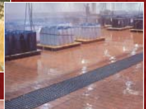
Carbo-Korez® floor in battery plant