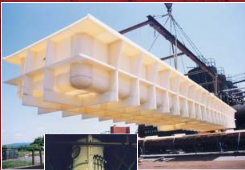
Polypropylene process tank