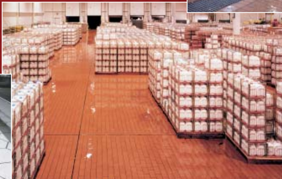
Furnane paver floor system in dairy