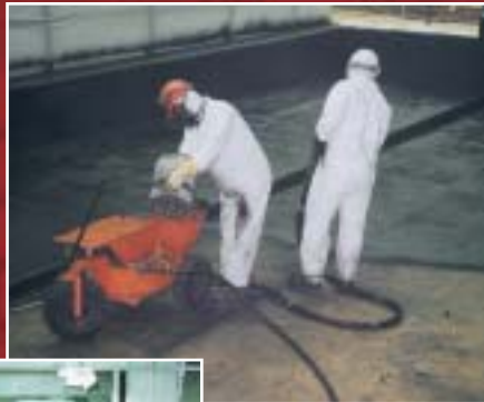
Epoxy spray floor system

Atlas' customer service department provides efficient order processing, response to inquiries, and timely, economical shipment of your order.