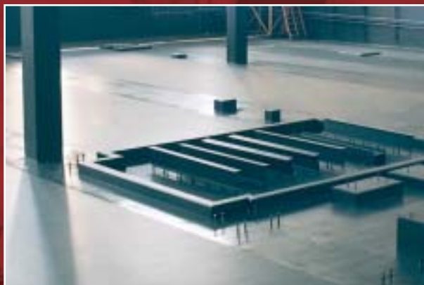
Vinyl ester polymer floor

Atlas' polymer flooring systems can be applied by hand or power trowel, broadcast, spray or self-leveling techniques.