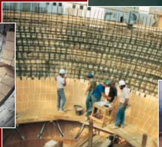
Chemester mortar in the chest