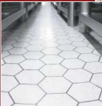
Atlas VTF System in processing plant