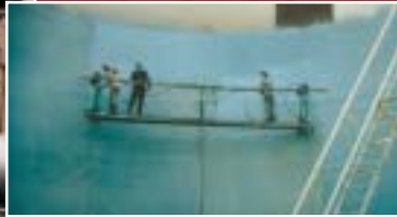
Chempruf waste treatment tank