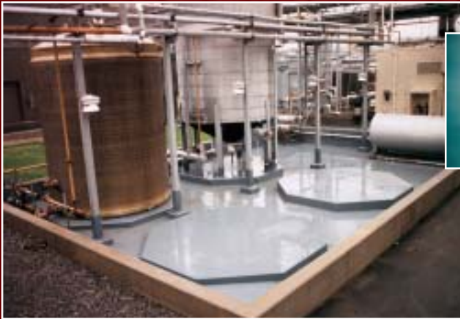
Chempruf containment pit