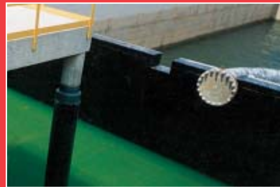
Anchor-Lok trench (top), Anchor-Lok tanks (bottom), Prefabricated Anchor-Lok sump (left).