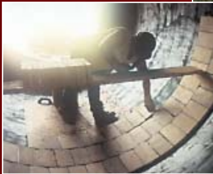
Atlastic 55 membrane