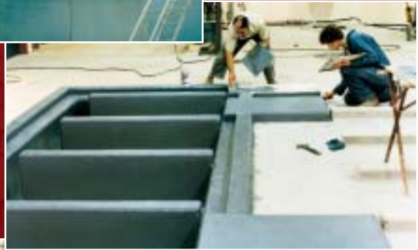
Chempruf pit and tank