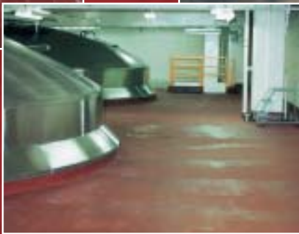
Epoxy novolac floor systems