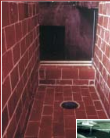
Chemical resistant brick