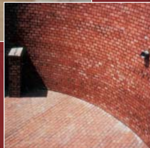
Zinc process vessel